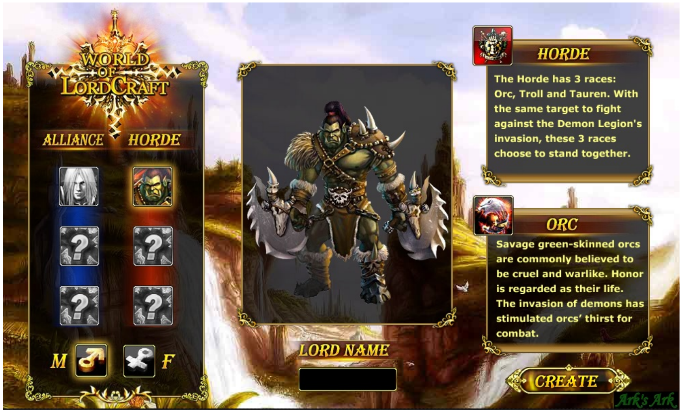
Elder Scrolls Character Creation Simulator